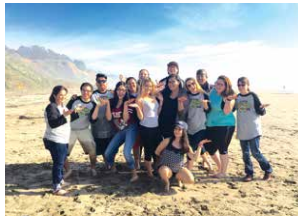
Retreats provide our youth with the opportunity to grow in their faith and form lasting friendships.

“I’ve come to understand that the desire to deepen and change has to