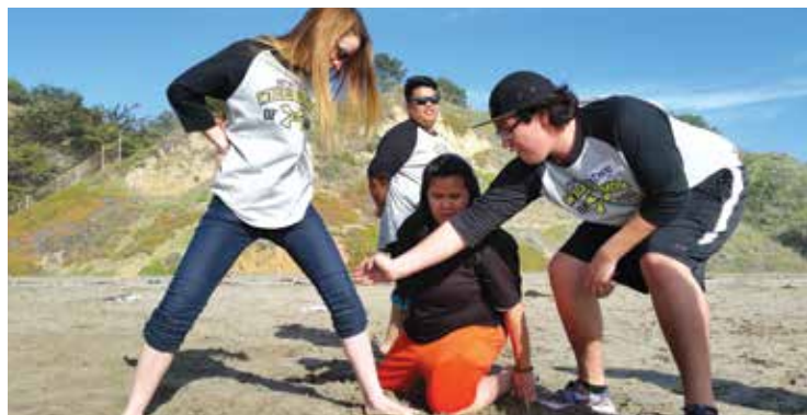
Youth Ministry programs allow our youth to be themselves with their peers – whether that means enjoying leisure time or learning about their faith together.

“I’ve come to understand that the desire to deepen and change has to be within the youths’ hearts. [Youth] have to take ownership of their Church. My role is to facilitate, because then they can go out and spread their wings in other areas of parish life. It’s not just our hope and our future, but it’s their hope, their future and their ownership.”